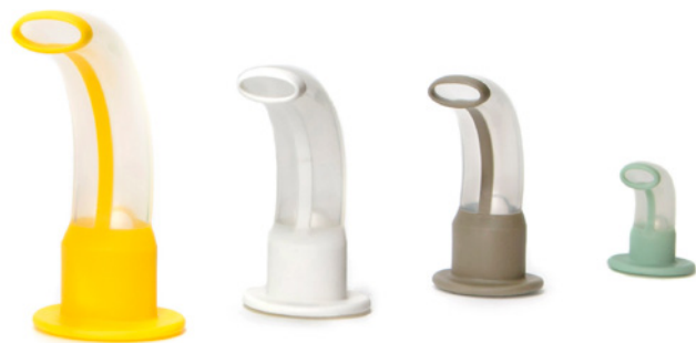
ISO Size 9.0 ISO Size 7.0 ISO Size 6.5 ISO Size 3.5

The four sizes of Intersurgical Guedel airways that have had their colors changed to conform to the updated standard.